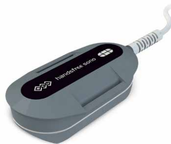
6 crystal HandsFree Sono® applicator BTL-Sono-6