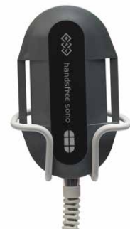
HandsFree Sono® holder for plastic trolley BTL-Sono-PT