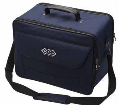
Carry bag for BTL-4000 Smart/Premium BTL-4000-Bag