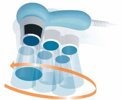
Hand operated application by a therapist