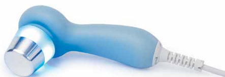
5 cm 2 applicator BTL-4000-5cm