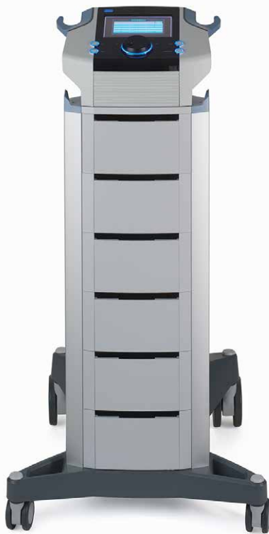
Cart for BTL-4000 Smart/Premium BTL-4000-Cart