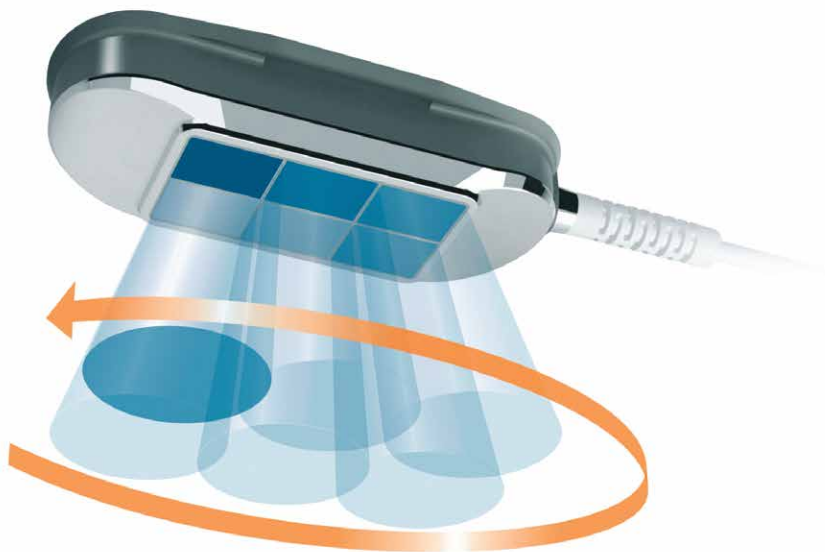
Automatic application by the HandsFree Sono®

The BTL HandsFree Sono® brings the unique Rotary Field Technology. It is the first ultrasound applicator on the market which creates electronically precise rotating ultrasound field without necessity of a therapist activity. This outstanding technology enables very fast, effective and comfortable treatment and reduces operator fatigue.