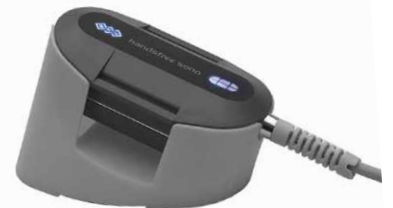
Plastic holder for HandsFree Sono® BTL-Sono-PH