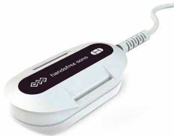
4 crystal HandsFree Sono® applicator BTL-Sono-4