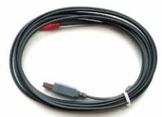
BTL 4000 Channel 2 Lead Dark Grey BTL-4000-L2