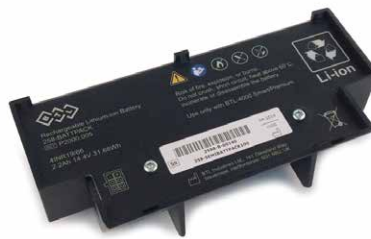
Battery Pack BTL-4000-Battery