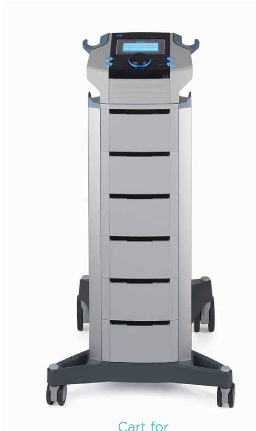
Cart for BTL-4000 Series Smart/Premium BTL-4000-Cart