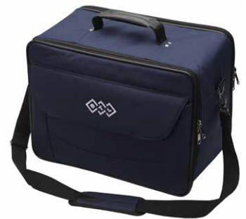
Carry bag for BTL-4000 Series Smart/Premium BTL-4000-Bag