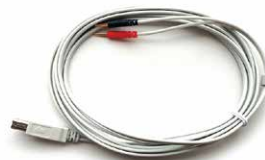
BTL 4000 Channel 1 Lead Light Grey BTL-4000-L1