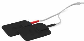
Re-usable rubber electrodes (5x7 cm) BTL-4000-E1