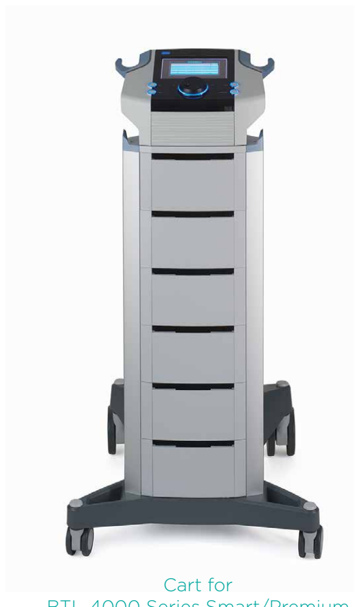
BTL-4000 Series Smart/Premium BTL-4000-Cart