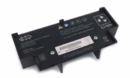
Battery Pack BTL-4000-Battery