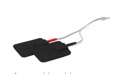
4 re-usable rubber electrodes (5x7 cm) BTL-4000-E1