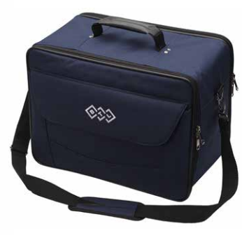
Carry bag for BTL-4000 Smart/Premium BTL-4000-Bag